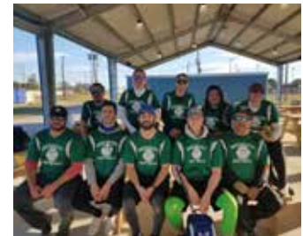
4th PLACE AMOCO FCU

SATURDAY, OCTOBER 20TH, 2018 Houston Sportsplex 12631 South Main, Houston, TX 77035