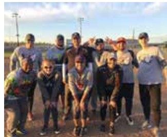
2nd PLACE First Community FCU