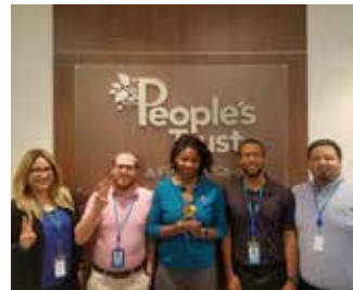
3rd PLACE People's Trust FCU