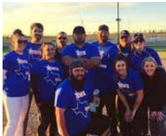
1st PLACE ACU of Texas