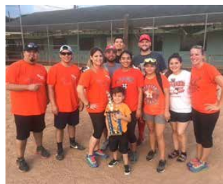
2nd PLACE People's Trust FCU