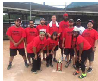
3rd PLACE Houston Fire Fighters