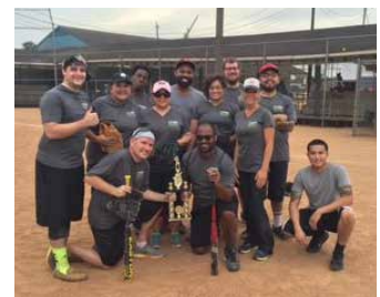
4th PLACE Cy-Fair FCU

SATURDAY, OCTOBER 28TH, 2017 Houston Sportsplex 12631 South Main, Houston, TX 77035