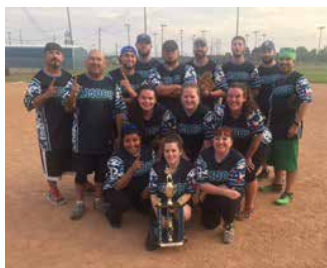
1st PLACE AMOCO FCU